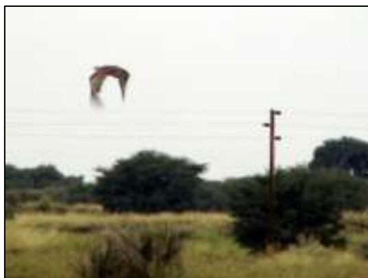
Did this Kori Bustard actually see the power line it has just crossed, or did it fall within its "blind spot"?

Foraging patches, conspecific models or alerting sounds placed a suitable distance from the hazard may be an effective way of reducing collisions in certain locations. However, there is unlikely to be a single effective way to reduce collisions for multiple species at any one site. Warning or diversion and distraction solutions may need to be tailored for particular target species.