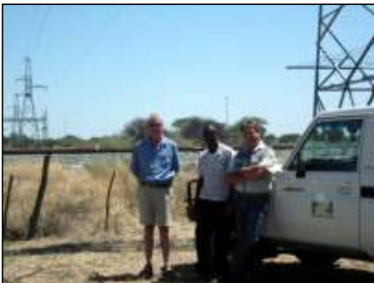
Top: The large Omuramba Owambo runs west-east and is intersected by the 132 kV power line at this point (S18 38.334 E17 11.408).