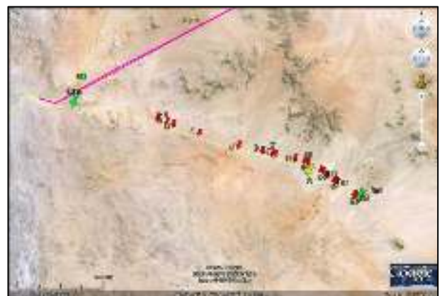
Google image showing detail of section of power line surveyed (between green markers); incidents recorded (red markers); start of initial area of concern reported by C. Mannheimer (yellow marker (based on a Google map generated by EIS 2011). Note how power line crosses potential bustard flightpaths along dry water courses/washes running from north-east to south-west.

Motivation for survey: see above report from Coleen Mannheimer (17/8/11). These findings were cause for concern, and a dedicated survey of the power line was regarded as a priority.