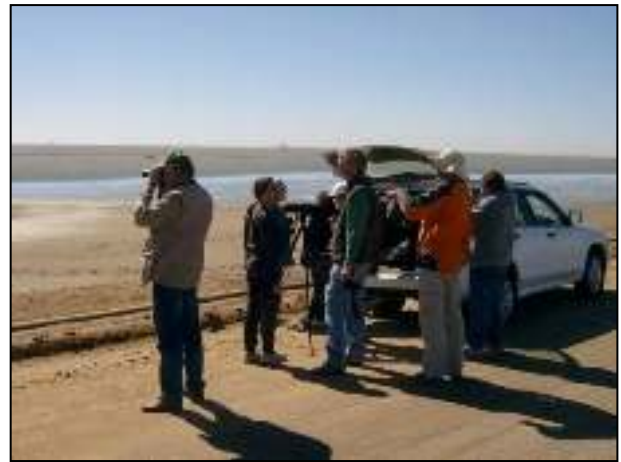
Bird watchers provide essential information for tracking flamingo movements from the ground.

The NamPower/Namibia Nature Foundation Strategic Partnership has initiated the Namibia Flamingo and Power Line Project, with co-funding from the Nebank Go Green Fund (see above). The present initiative is a sub-project of