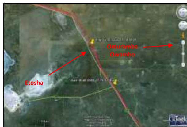
The survey area (between two yellow markers) east of Etosha (after a Google map generated on the EIS).

Motivation: A collision event involving 20± flamingos on the Gerus-Zambezi 350HVDC transmission line north-east of Grootfontein, between Tower 472 (-19.3218S 18.5317E) and 491 (-19.2457S 18.5895E), was reported on 2/11/09 (see newsletter No. 4, June 2010). The collision site lies on a suspected flight path for flamingos between Etosha and Nyae Nyae Pans, near Tsumkwe in Bushmanland.