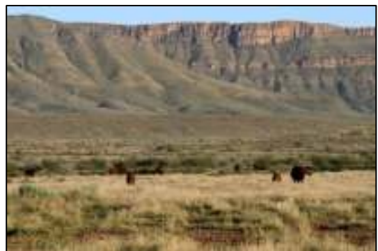
Top: The 33 kV HPCD private power line surveyed at Büllsport.