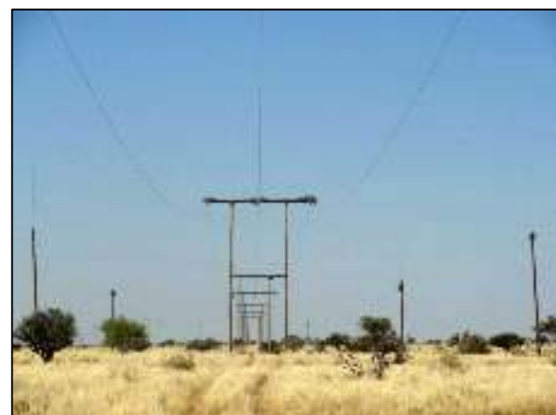
Top and centre: Dummy poles placed next to the Koes 33 kV retic. line.