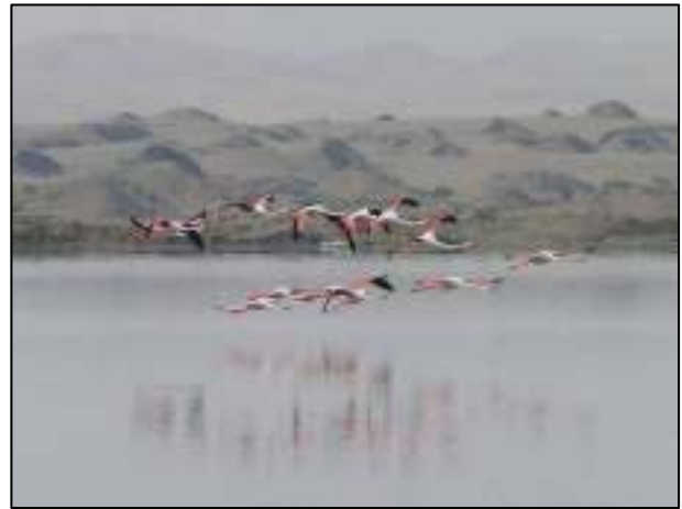
Flamingos flying low in the Kuiseb Delta. Both Greater Flamingo and Lesser Flamingo are Vulnerable Red Data Book species in Namibia; Lesser Flamingo is also Globally Near-threatened . Generous funding to track the flight paths of such wetland flagships will promote the development of effective mitigation measures for collisions on power lines.

Because of the expense of applying mitigation measures to both old and new power lines, it is necessary to establish flamingo flight paths in order to investigate specific sites/routes for mortalities; to confirm whether there is a problem or not and, if so, the scope of the impacts; and to feed the information to power line planners and EIA practitioners in terms of planning for new power lines. With the expansion of mining and other developments on the coast of Namibia and the associated increase in the need for power, this aspect is particularly pertinent, in order to promote sustainable development. It is also imperative to establish conclusively exactly how many Blue Cranes remain in Namibia; and which areas they move to when they leave Etosha, so that awareness