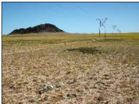
Top: The survey team included (L to R) Mike Scott, Michael Tjikune and Ann Scott. Bottom: Remains of bustards found beneath the Rosh Pinah – Lüderitz 66 kV line.

Results: Remains of 24 collision incidents involving Ludwig's Bustard, including at least two incidents involving more than one bird. Sixty-five live Ludwig's Bustards were observed (including at least one juvenile). The birds were seen flying up and down dry watercourses; flight low and clumsy, sometimes just clearing power lines, sometimes flying beneath lines. Bustards were recorded in areas with green flush of grass and other vegetation after good rains. Signs of active scavenging by jackals: only a few bones remained of all the carcasses; heads and beaks, legs, wings and feet were all eaten. Piles of feathers that were found were in most cases fresh and, given the high scavenging rates, it is concluded that the incidents were recent.