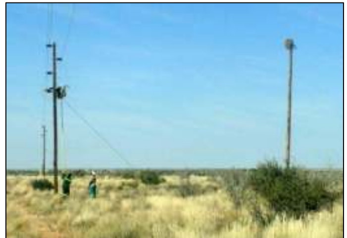
NamPower has initiated mitigation trials to address outage problems caused by Sociable Weaver nesting in the South, making use of "dummy poles" (right; photo Pieter Cloete )

The Energy White Paper, Vision 2030 and NDP3 set ambitious objectives for the Namibian energy sector and acknowledge the vital role played by energy in the country's economy and development. The power line network coverage across Namibia is increasing rapidly as a result of the installation of lines for new mining and other developments as well as many new private lines, and the Government's effort to give access to affordable and appropriate energy supplies to households and communities. The construction of power lines is a necessity; but in doing so there are potential adverse effects on the environment. Fortunately, power suppliers are sensitive to these impacts, and much is being done to address them.