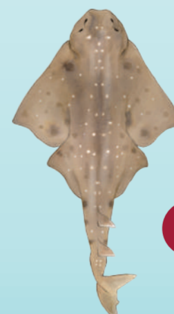
CR Smoothback angelshark Squatina oculata

Of the 87 species of chondrichthyans (sharks, skates, rays and ghost sharks) recorded in Namibian waters, 6 species are listed as Critically Endangered and 11 as Endangered on the IUCN Red List of Threatened Species.