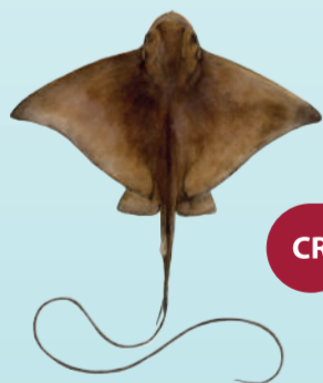
CR Bull ray Myliobatis aquila