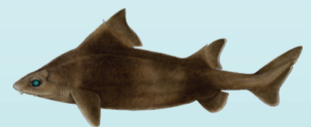
EN Angular roughshark Oxynotus centrina