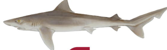
CR Tope / soupfin shark Galeorhinus galeus