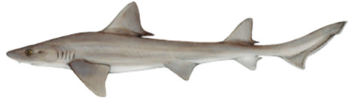
EN Smoothhound Mustelus mustelus