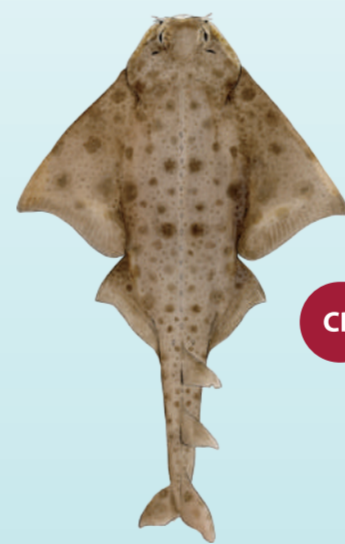
CR Sawback angelshark Squatina aculeata