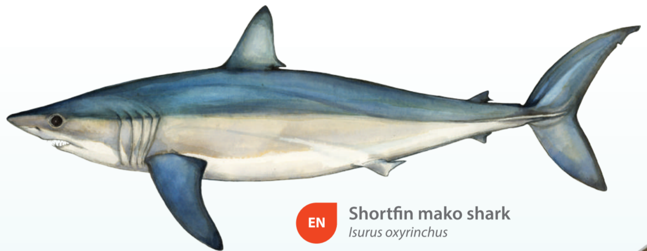
EN Shortfin mako shark Isurus oxyrinchus