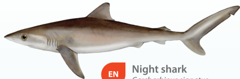
EN Night shark Carcharhinus signatus