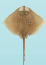
EN Twineye skate Raja ocellifera