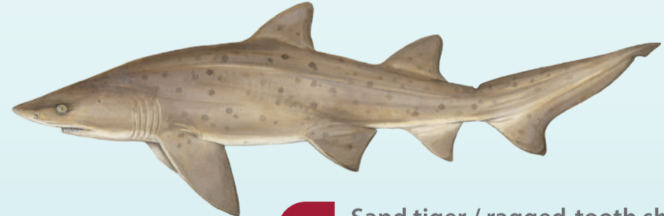
CR Sand tiger / ragged-tooth shark Carcharias taurus