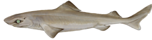
EN Gulper shark Centrophorus granulosus

Very high risk of imminent extinction in the wild.