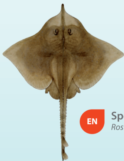
EN Spearnose / white skate Rostroraja alba