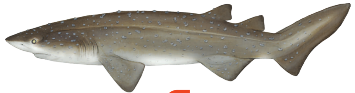
EN Bramble shark Echinorhinus brucus